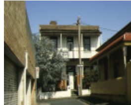
1 residence 18 berry street richmond front view