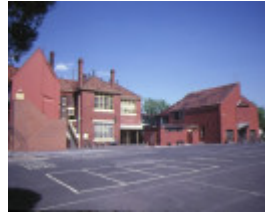
Primary School No. 2798, Davison Street Richmond, rear view, Nov 1984