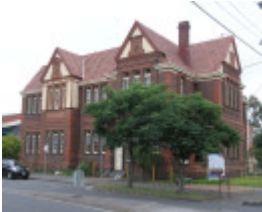
PRIMARY SCHOOL NO. 2798 SOHE 2008