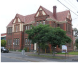
PRIMARY SCHOOL NO. 2798 SOHE 2008