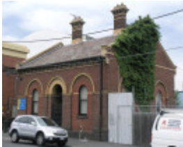
FORMER GAS INSPECTOR'S RESIDENCE SOHE 2008