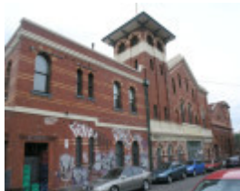
FORMER RICHMOND POWER STATION SOHE 2008