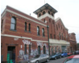
FORMER RICHMOND POWER STATION SOHE 2008