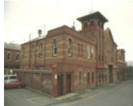
1 former richmond power station oddys lane richmond front corner elevation 1994