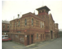
1 former richmond power station oddys lane richmond front corner elevation 1994