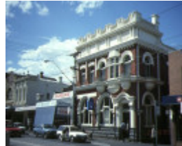
1 state bank swan street richmond front view