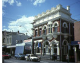
1 state bank swan street richmond front view