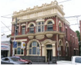
STATE BANK SOHE 2008