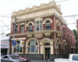
STATE BANK SOHE 2008