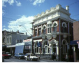
1 state bank swan street richmond front view