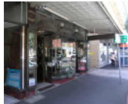
BRINSMEADS PHARMACY SOHE 2008