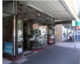
BRINSMEADS PHARMACY SOHE 2008