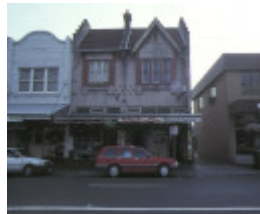
1 brinsmeads pharmacy glen eira road ripponlea front view