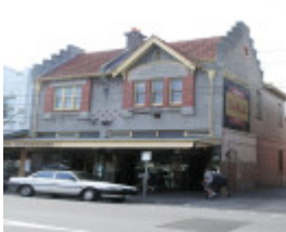
BRINSMEADS PHARMACY SOHE 2008