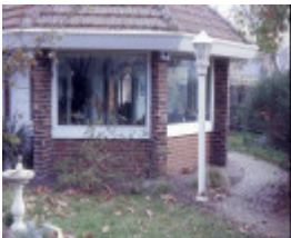
h00842 tintara lyndon street riponlea sunroom she project 2003