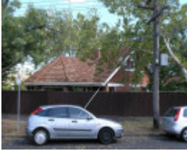
TINTARA SOHE 2008