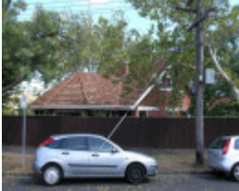
TINTARA SOHE 2008