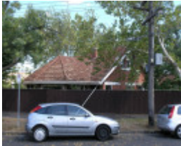
TINTARA SOHE 2008