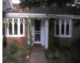
1 tintara lyndon street ripponlea front entrance apr1989