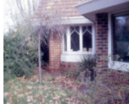
h00842 tintara lyndon street ripponlea bay window dining room she project 2003