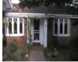
1 tintara lyndon street riponlea front entrance apr1989