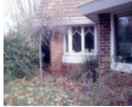
h00842 tintara lyndon street riponlea bay window dining room she project 2003