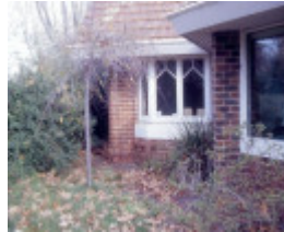
h00842 tintara lyndon street ripponlea bay window dining room she project 2003