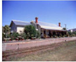
Rosedale Railway Station