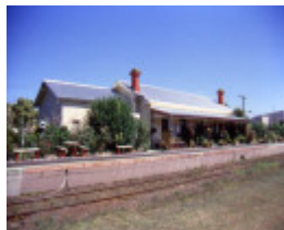
Rosedale Railway Station