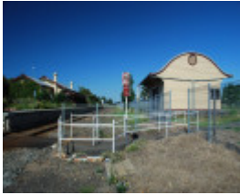
ROSEDALE RAILWAY STATION COMPLEX SOHE 2008