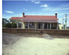
1 rosedale railway station complex willung road rosedale front view feb 1985