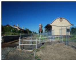
ROSEDALE RAILWAY STATION COMPLEX SOHE 2008