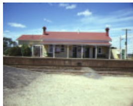
1 rosedale railway station complex willung road rosedale front view feb1985